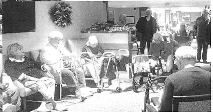
Serving up Thanksgiving Dinner