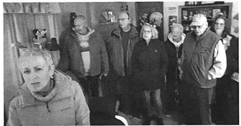
Saint Nick Celebration Santa's Helper gift wrapping for Adopt-a-Family